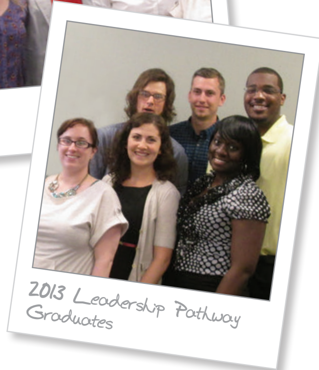
2013 Leadership Pathway Graduates

SPIN's four Pillars of People First, Professionalism, Performance Excellence, and Productivity guide us in our every action. SPIN's standards of quality and excellence are rooted in a highly caring, qualified, skilled and competent workforce.